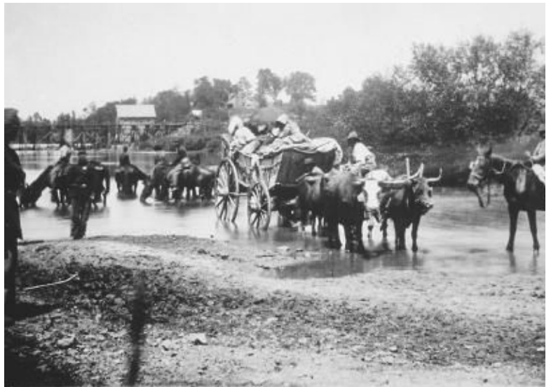
Freed slaves leaving the South